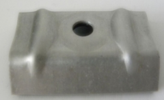
Stamping parts 2