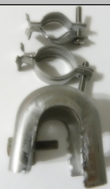
Pipe Clamps 2