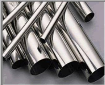
Steel Tubes 1