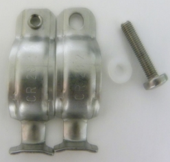
Pipe Clips 1