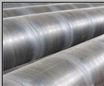
Steel Tubes 2