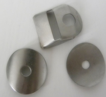
Stamping parts 1