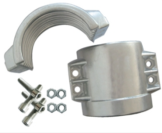
Pipe Clamps 1