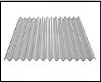
Steel Floor Decking