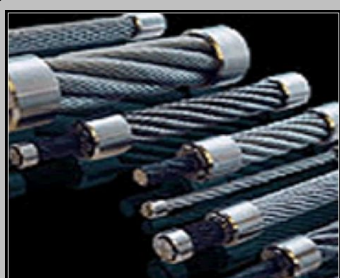
Wire Ropes 2