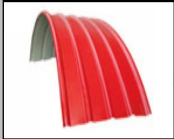
Corrugated Steel Sheets 1