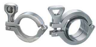
Pipe Clamps 3