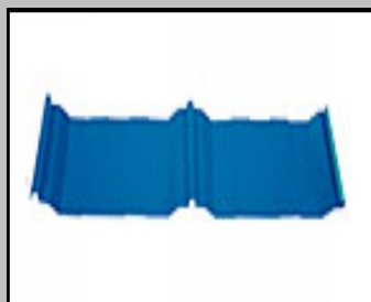
Corrugated Steel Sheets 2